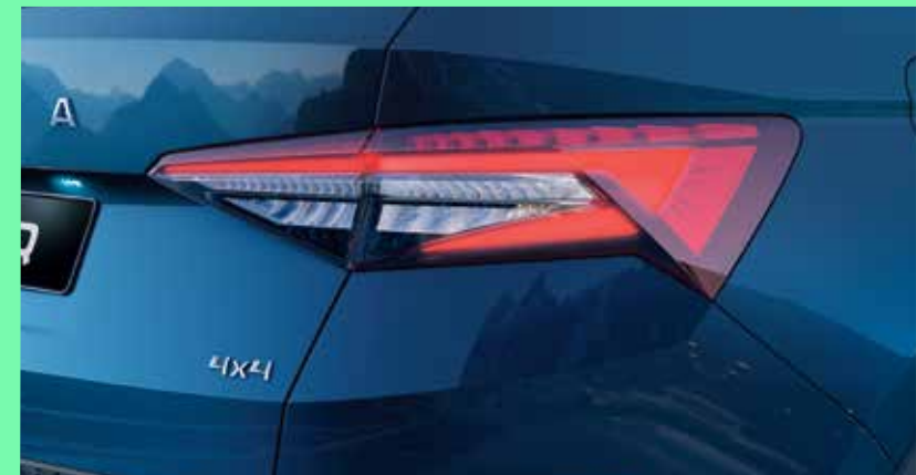
Škoda Crystalline Full LED Tail Lights with Dynamic Turn Indicators

Enhance Your Exploration with Light Design