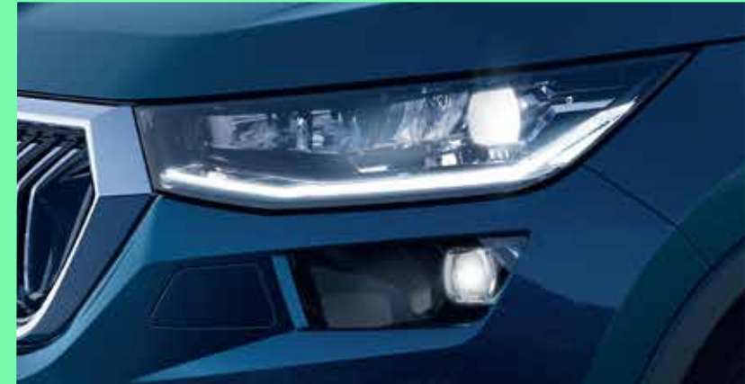
Škoda Crystalline Full Led Headlights With Illuminated "Eyelashes"