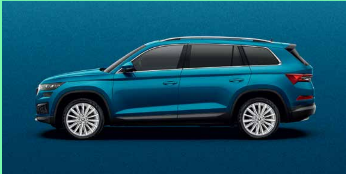
Lava Blue Metallic