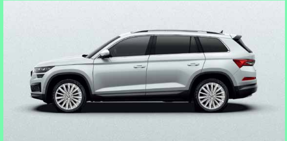
Moon White Metallic