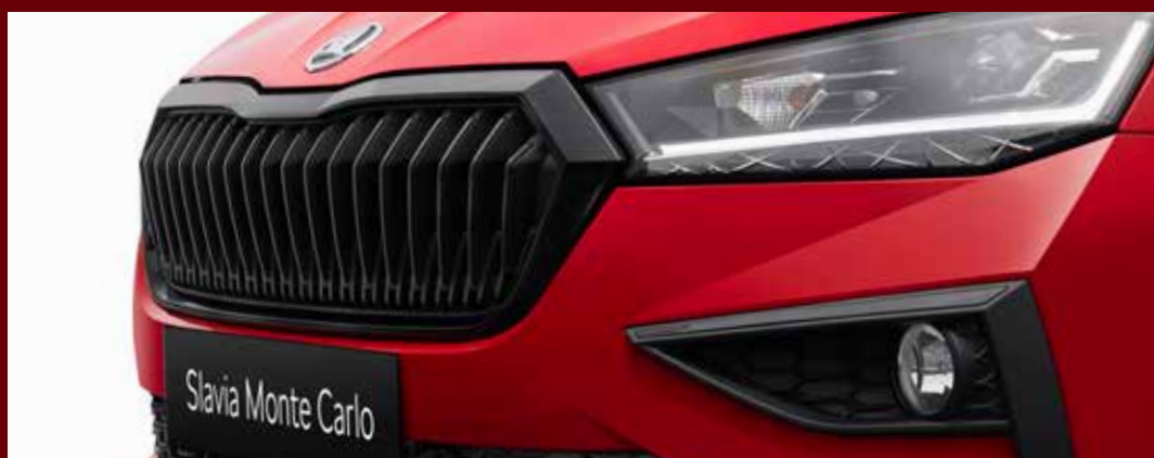
»» Black Škoda Signature Grill