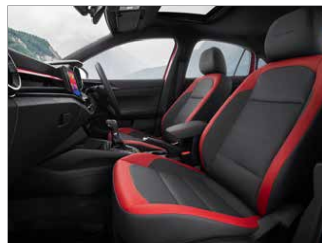
»» Monte Carlo Incribed Ventilated Front Leatherette Seats