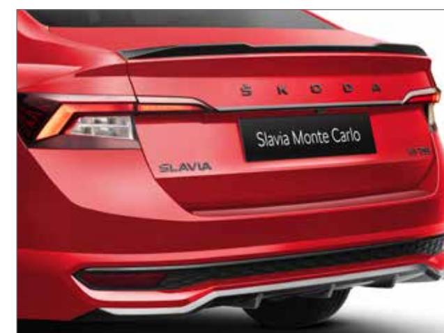
»» Sporty Black Exterior Package