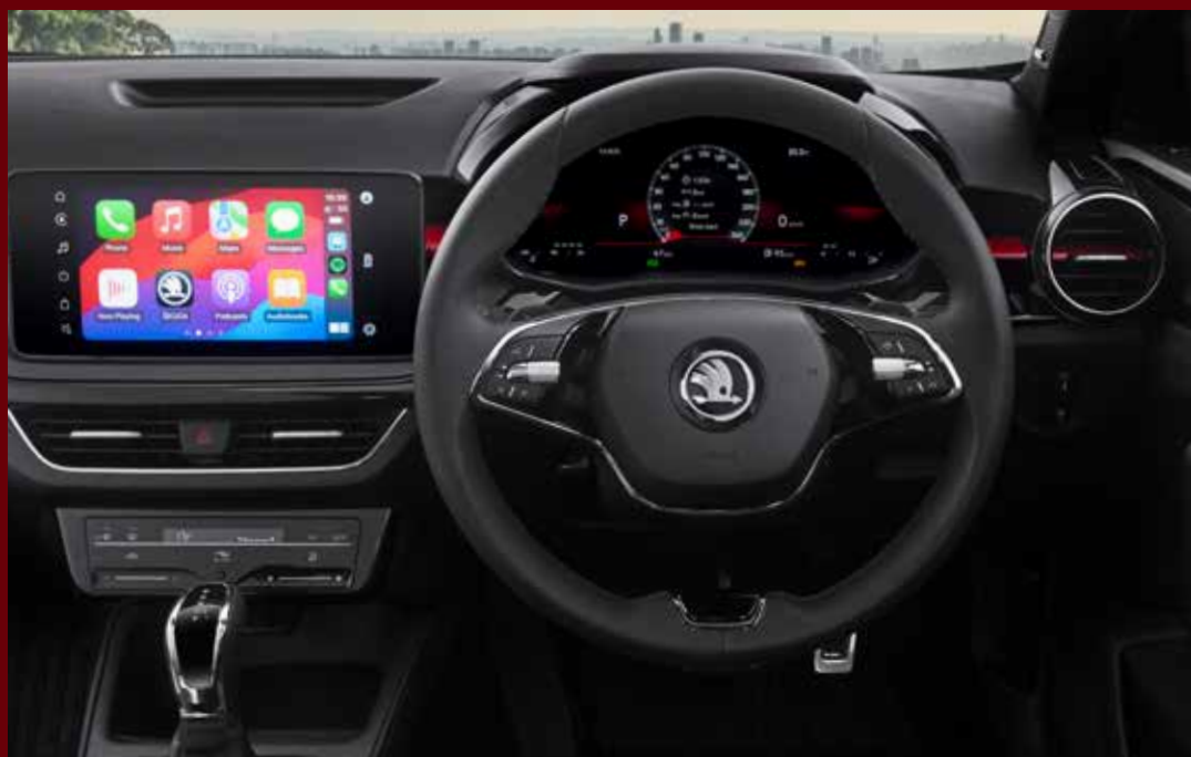
»» 20.32cm Škoda Virtual Cockpit with Red Theme