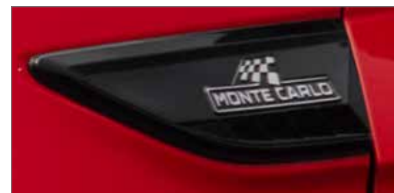
» Exclusive Monte Carlo Badging