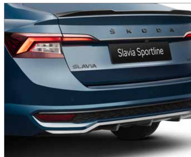
»» Sporty Black Exterior Package