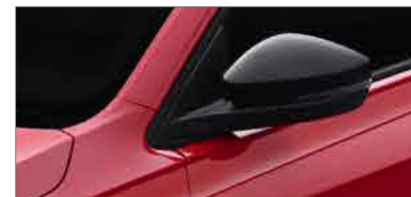
» Glossy Black ORVMs