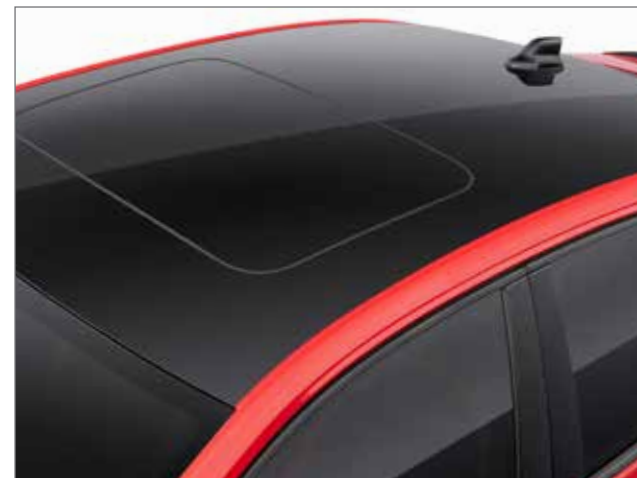
»» Dual Tone Electric Sunroof