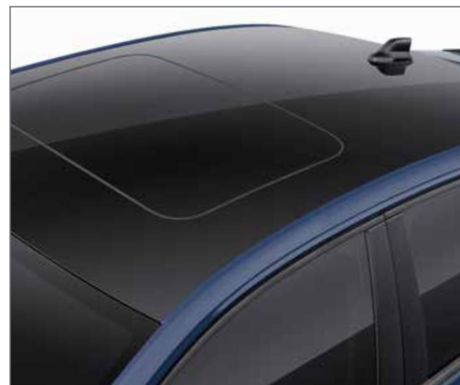
»» Dual Tone Roof with Electric Sunroof